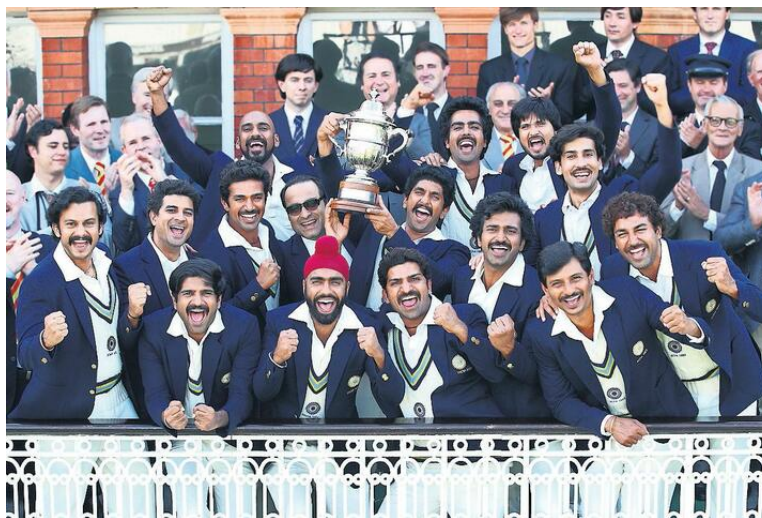
▲ The cast of 83 went to great lengths to imitate their real-life counterparts

"People sometimes ask me: 'Would you want to do 2011?'" Khan said, referring to India's second World Cup win, in Mumbai. "And I've often said that 2011 is not really a story. In